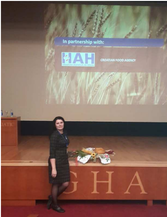
T.Rakcejeva 8th International Congress on Flour-Bread and the 10th Croatian Congress of Cereal Technologists, 28–31 October, 2015, Opatia, Croatia